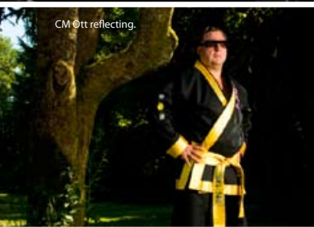
CM Ott reflecting.

carved out edges—a true weapon that can be taken any place. The second was a painting of me, riding on one of my favorite animals, the buffalo. It is without question, a gift from the heart. This masterful work of art was created by Grandmaster Billy Burchett's sister.