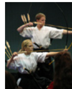
Training camp participants