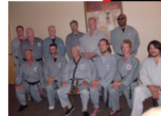
2nd Annual Global Conference