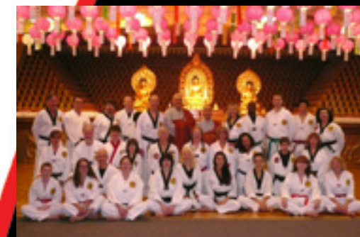
Chosun students at WonKakSa Temple