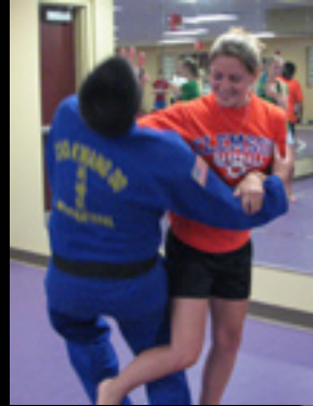
Self-defense training at Clemson